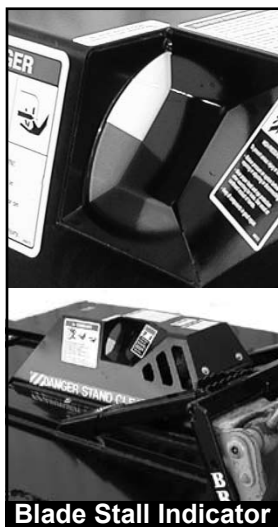
Blade Stall Indicator