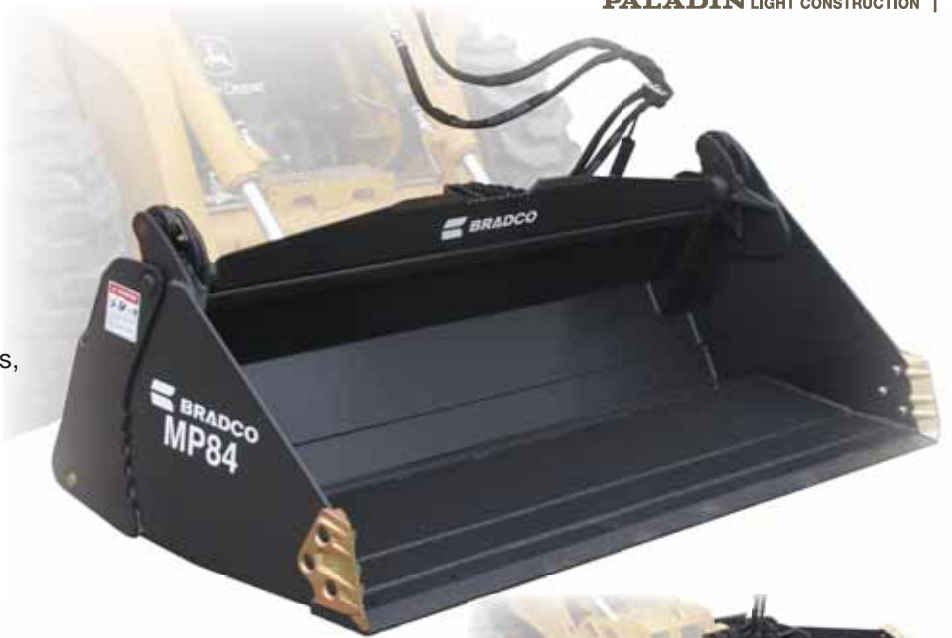
Construction Grade Shown with optional side cutters and spill guard